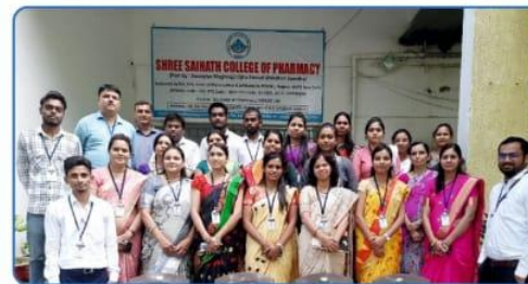
Teaching and Non-Teaching Staff

An accomplished team of faculty teaches at the Institute as their selection is based on their teaching acumen of research excellence.