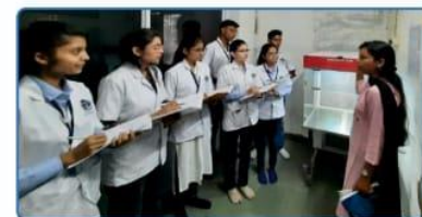
Laminar Air Flow (Microbiology Lab)

The aseptic room of microbiology lab has facilities like incubators, Laminar Air Flow Unit, Oven, Autoclave.