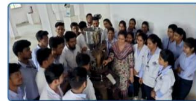
Tablet Punching Machine (Pharmaceutics Lab)

Pharmaceutics is concerned with the strategies by which biologically active compounds are presented to the body so as to elicit an optimal response. It includes the design, preparation and testing of drug delivery systems. The department has a machine room, Pharmaceutics laboratory I (General and Dispensing Pharmacy), Pharmaceutics lab II (Unit Operation).