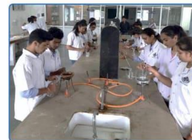
Pharmaceutical Chemistry Lab

Pharmaceutical Chemistry and Analysis of Drugs form the backbone of research and Development in Pharmaceutical Industry. The department focuses on training the students on how to use modern and newer instrumental analytical techniques such as HPLC, and UV -Visible Spectroscopy.