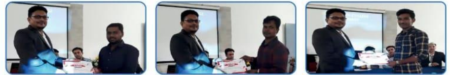
Felicitation of GPAT Qualified and Topper Students