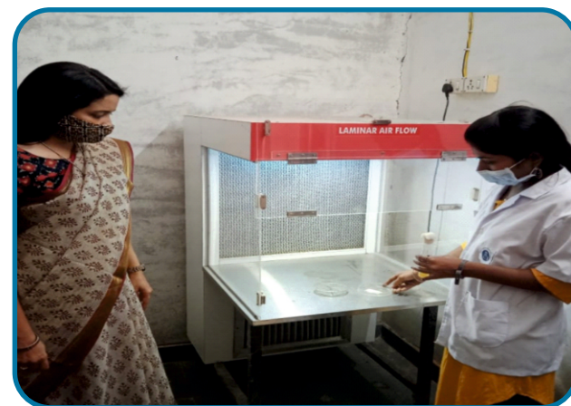
Laminar Air Flow (Microbiology Lab)