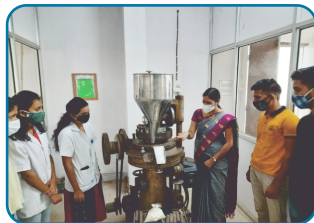
Tablet Punching Machine (Pharmaceutics Lab)

The aseptic room of microbiology lab has facility like incubators, Laminar Air Flow Unit, Oven, Autoclave.