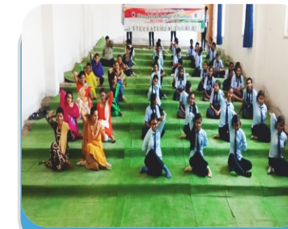
YOGA DAY CELEBRATION