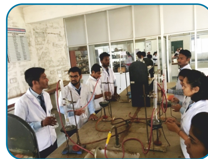
Pharmaceutical Chemistry Lab

Pharmaceutical Chemistry and Analysis of Drugs forms the backbone of research and Development in Pharmaceutical Industry. The department focuses on training the students on how to use the modern and newer instrumental analytical technique such as HPLC, UV-Visible Spectroscopy.